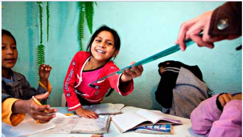
Internally displaced students in Pasto, Colombia (Photo: NRC/ Truls Brekke, December 2009).

Certificates of completion of grades or levels of education may be crucial to IDPs accessing further educational, vocational, or employment opportunities, yet these documents can be lost in displacement. In addition, the education of those who attend schools (formal or informal) in displacement may not be recognised, and they may not receive documentation. The principle of non-discrimination dictates that IDPs, like others, should be issued certificates of completion. Reliable systems of accrediting educational achievement help to enable durable solutions and ensure a free choice between settlement options. 77