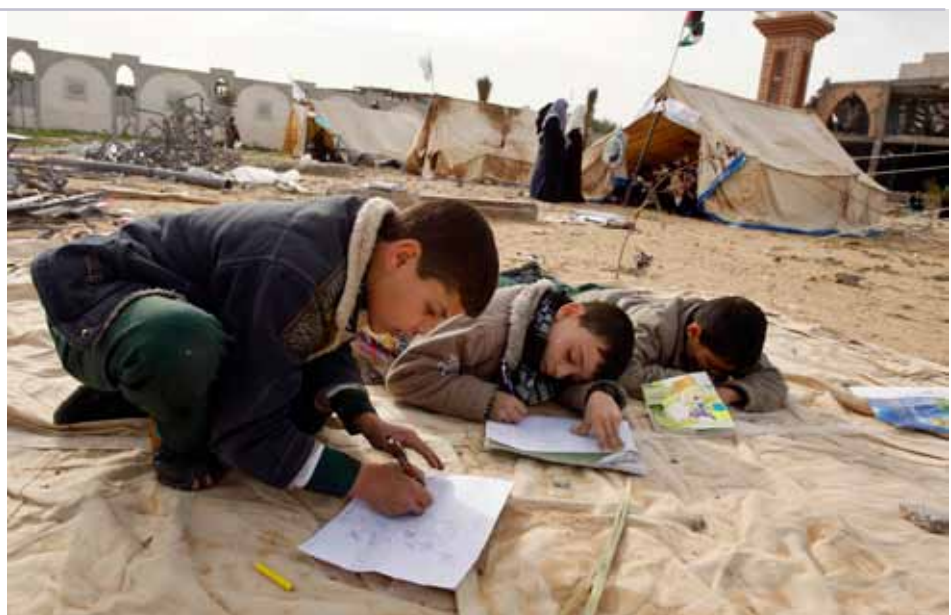
Internally displaced children at a school in Gaza, Occupied Palestinian Territory, which was destroyed during Israel's 2008 offensive (Photo: Reuters/Ibraheem Abu Mustafa, courtesy of www.alertnet.org , January 2009).

This paper introduces a series of case studies looking at education for IDPs. It examines the international human rights law framework for guaranteeing education to IDPs, focusing on issues such as non-discrimination and documentation that are particularly likely to arise in this context. Later papers in this series will look at methods of providing education in protracted displacement, using case studies to highlight problems and best practices.